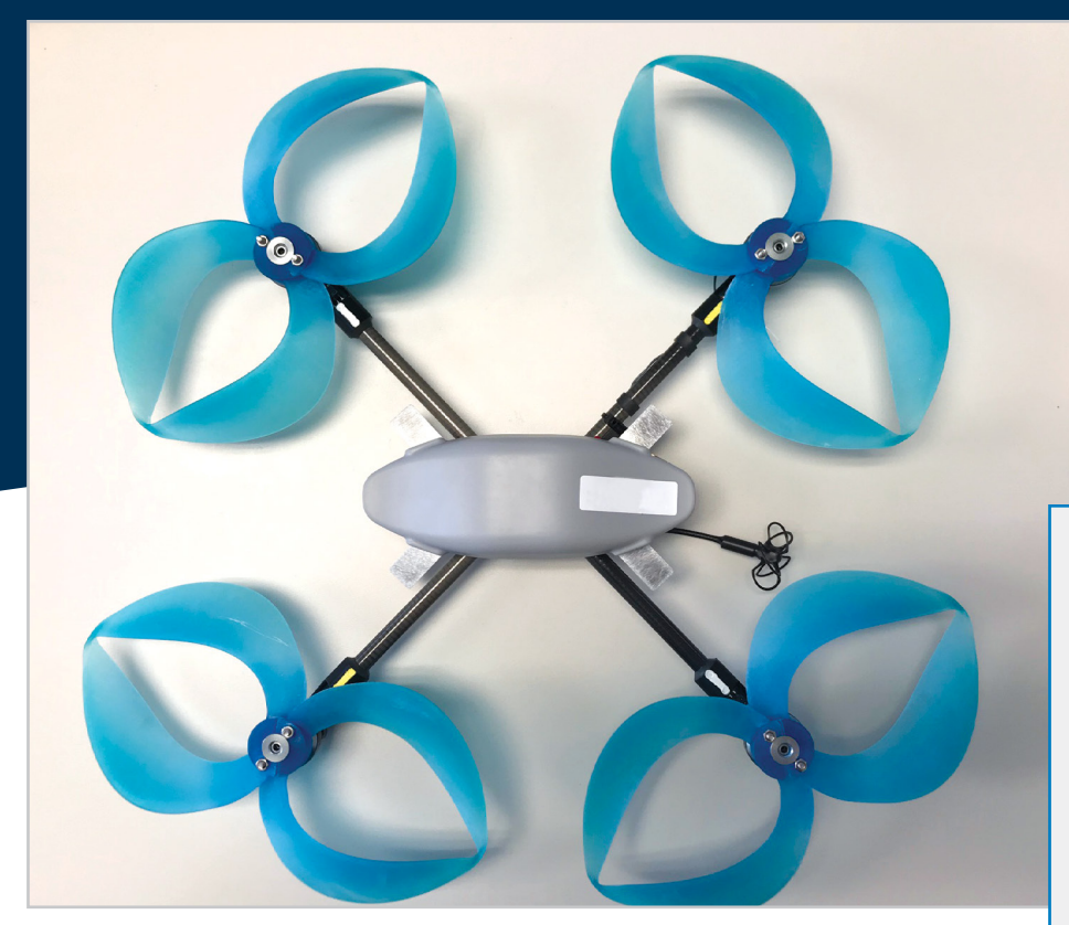
Toroidal propellers were installed on a commercial drone for testing.

The toroidal propeller allows a small multirotor unpiloted aircraft, or drone, to operate more quietly than current drones that use propeller forms unchanged since the beginning of aviation. By enabling a drone that is less of an acoustic annoyance, this propeller may accelerate the acceptance of such aircraft for a wide range of uses—for example, aerial deliveries, cinematography, industrial or infrastructure inspections, and agricultural monitoring.